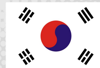
REPUBLIC OF KOREA